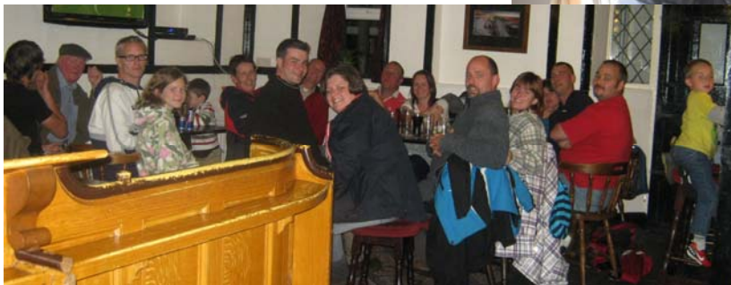
Enjoying the local hostelry.