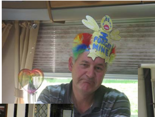
Just two of those who tried to get back on the field without their duck.