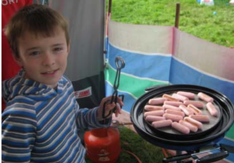
Preparing Breakfast for our ralliers.